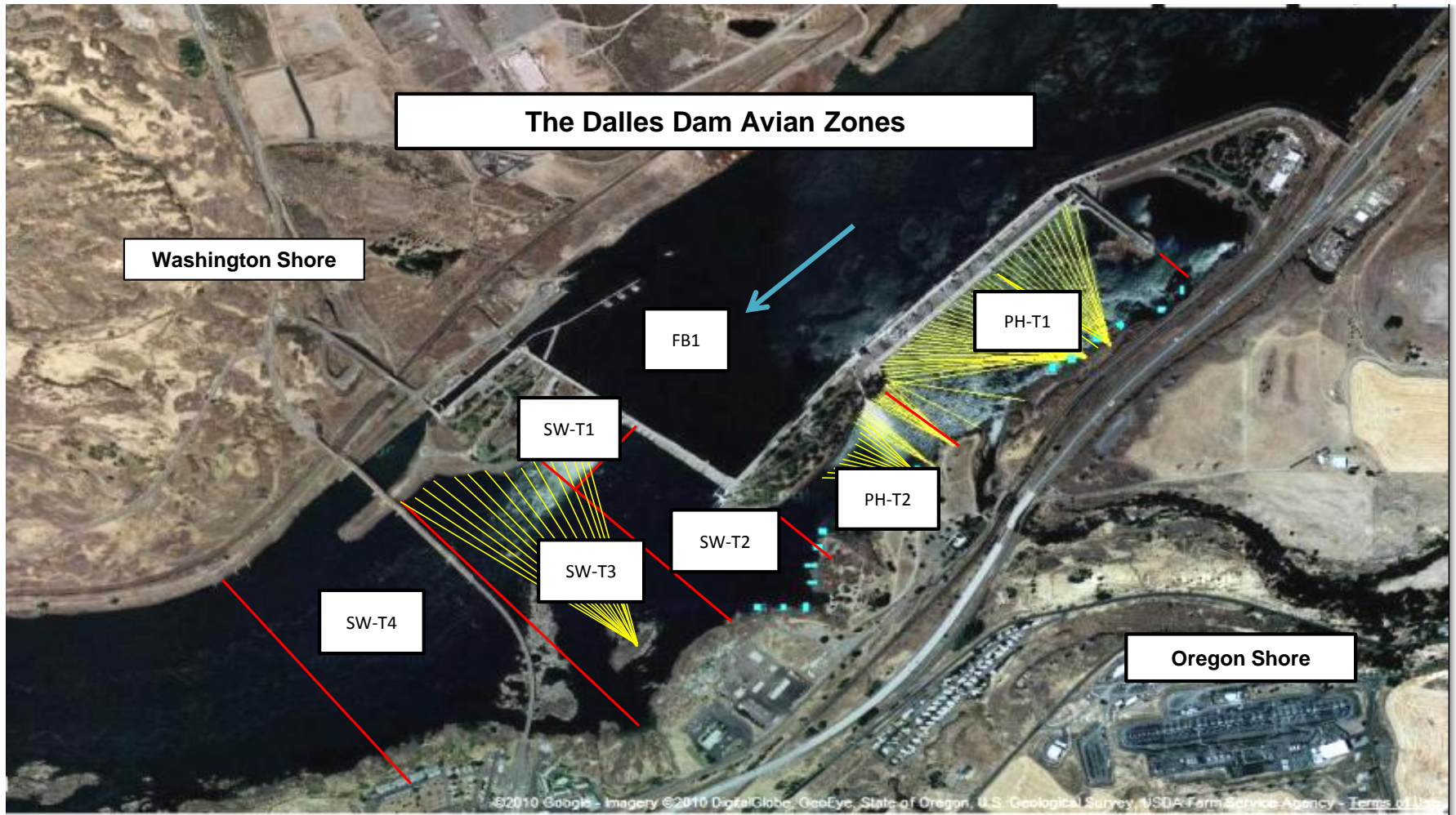
Avian lines in yellow, zones in red.